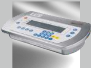
Type 82c plus*