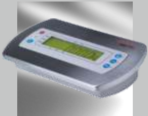
Type 82b plus*