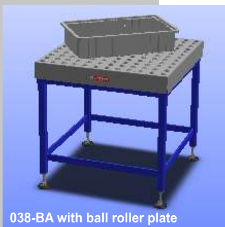
038-BA with ball roller plate