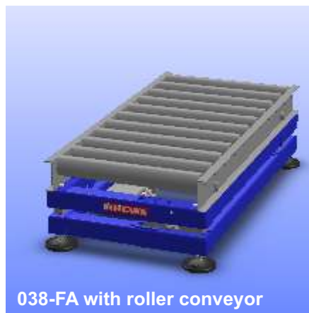
038-FA with roller conveyor