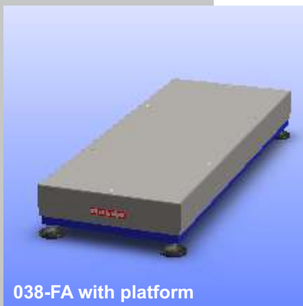
038-FA with platform

* Standard values, further versions on request.