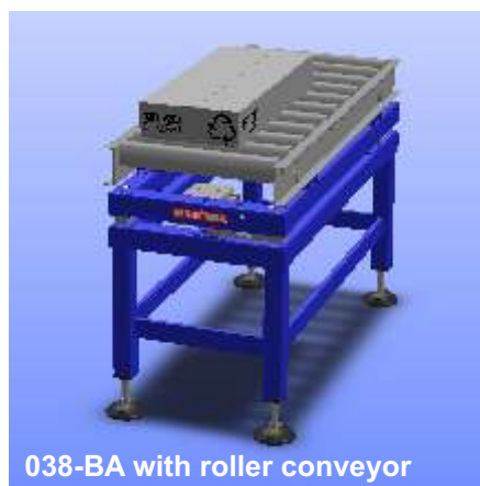
038-BA with roller conveyor