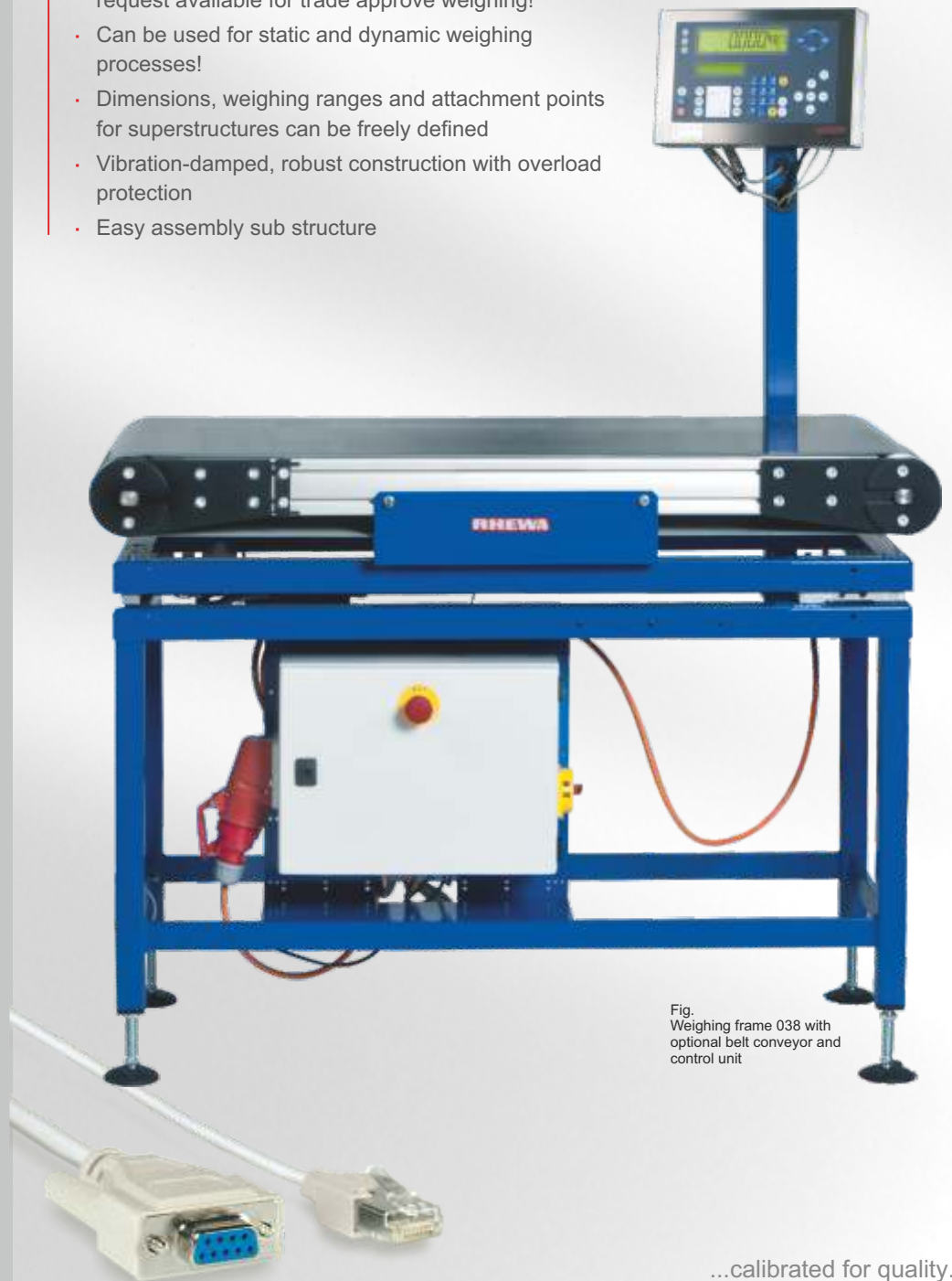
Fig. Weighing frame 038 with optional belt conveyor and control unit