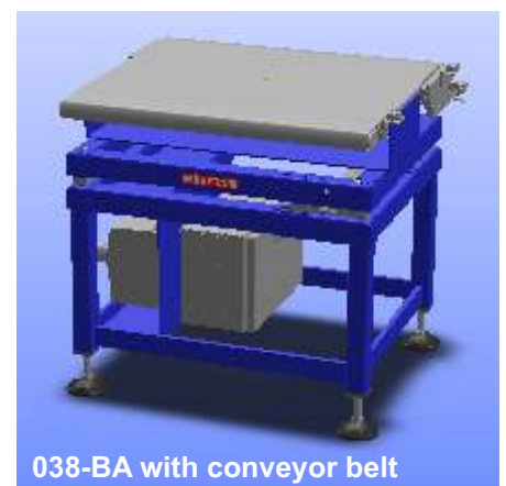
038-BA with conveyor belt